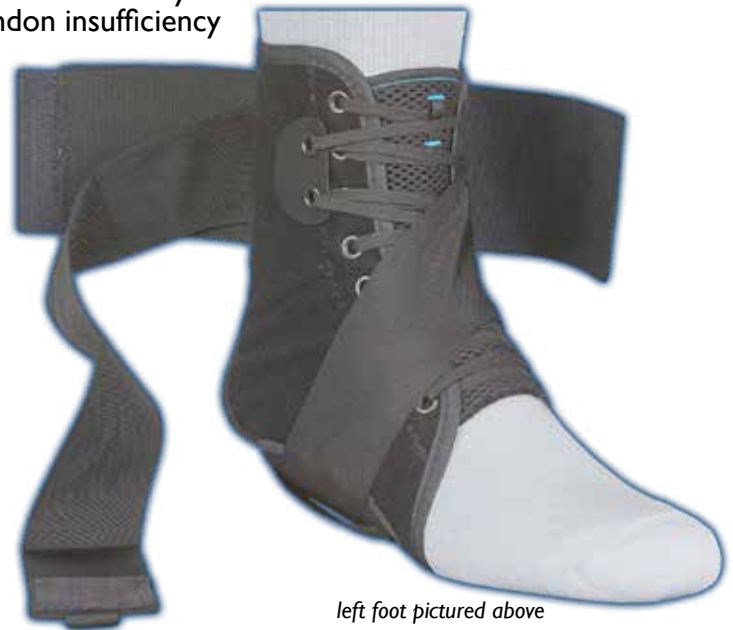
left foot pictured above