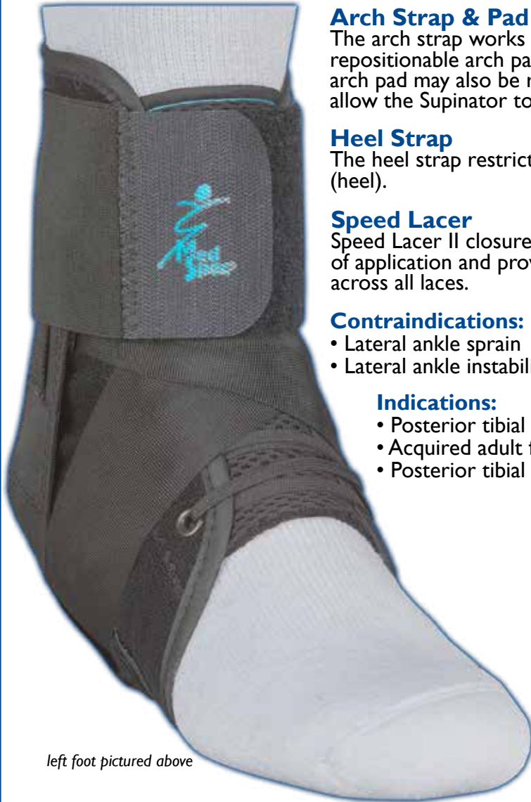
left foot pictured above