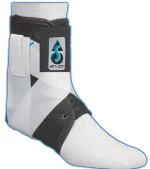
A portion of the elastic cuff has been removed and white straps used in the above photo for illustrative purposes.

For improved comfort and durability, there is no seam under the foot.