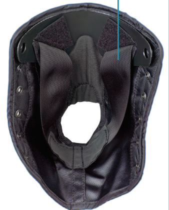
Inner cuff lining removed in the above photo to reveal plastic cuff system.

Inner stirrup strap is lined with Skinloc™ material and connected to internal plastic cuff to better capture the calcaneus (heel) and resist inversion or eversion of the ankle.