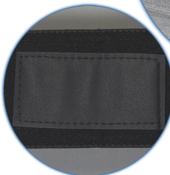
Lateral SkinLoc Pad