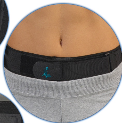
May be worn directly next to the skin