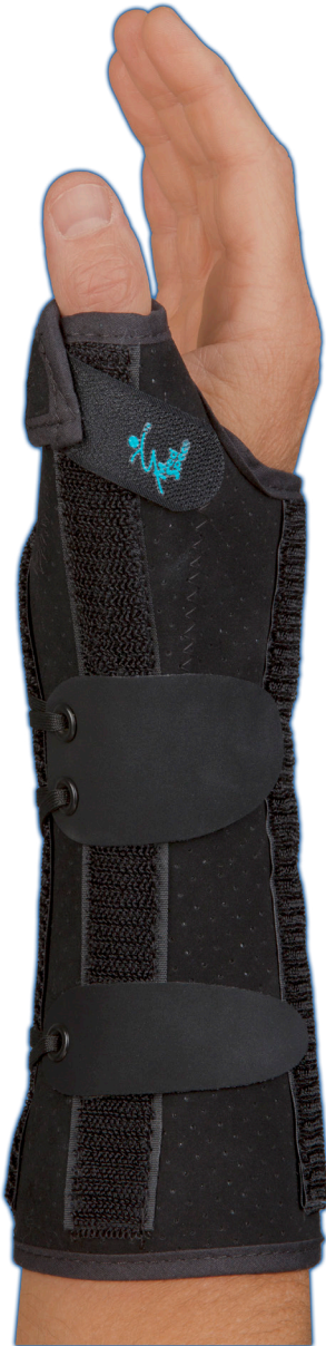
Long Ryno Lacer II