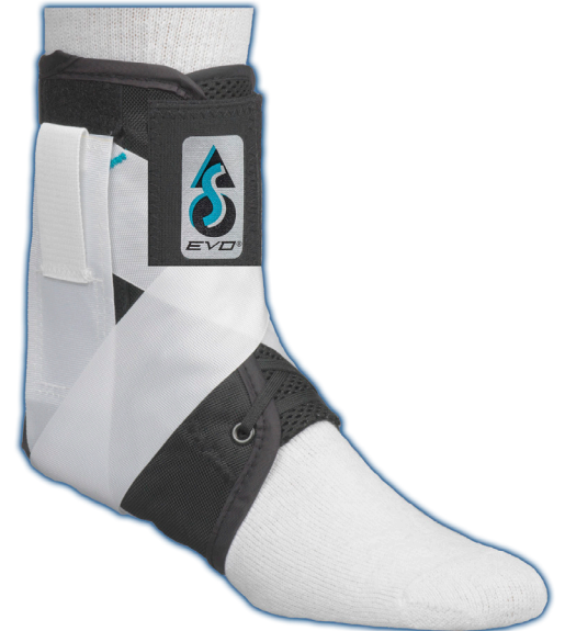
A portion of the elastic cuff has been removed and white straps used in the above photo for illustrative purposes.

For improved comfort and durability, there is no seam under the foot.