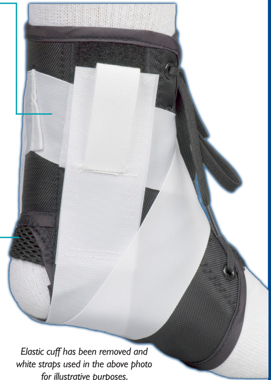
Elastic cuff has been removed and white straps used in the above photo for illustrative purposes.

CoolFlex ™ padding contains spandex fiber to provide superior comfort along the Achilles tendon and dorsum of foot. The shoe lace is attached to the tongue to ensure lace is always centered.