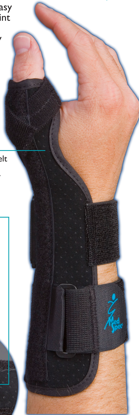
Long Suede Thumb Support