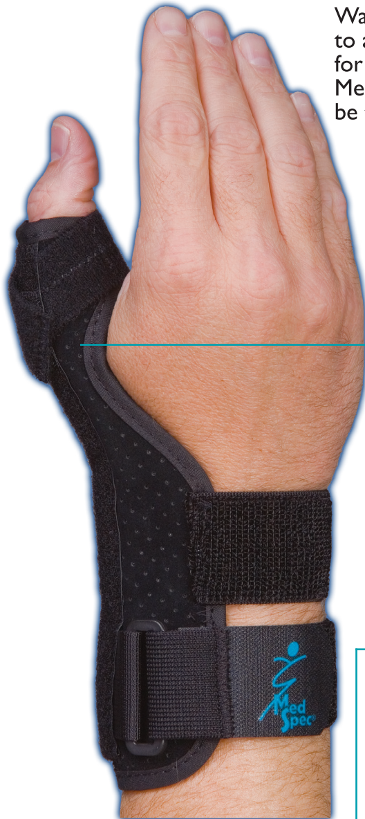
Short Suede Thumb Support

The inner elastic strap and the outer closure strap work in concert to allow for an easy and secure closure around the thumb.