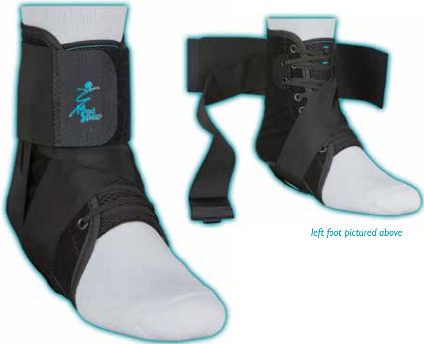
left foot pictured above

See sizing chart on page 4 Patent pending