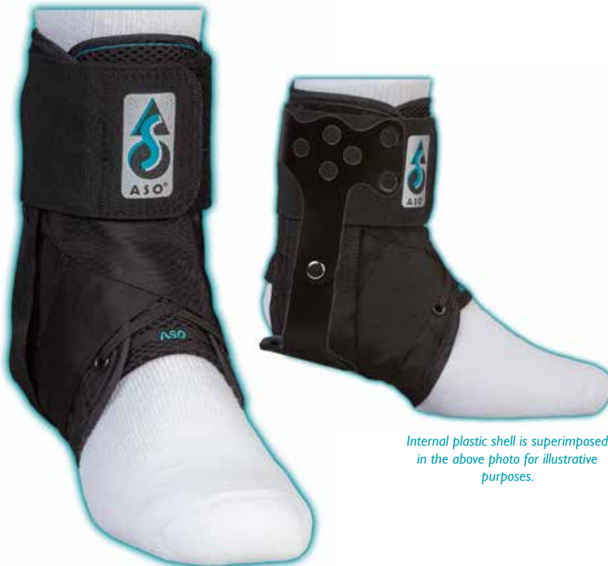
Internal plastic shell is superimposed in the above photo for illustrative purposes.