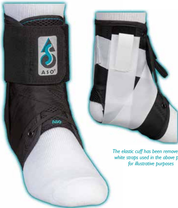
The elastic cuff has been removed and white straps used in the above photo for illustrative purposes