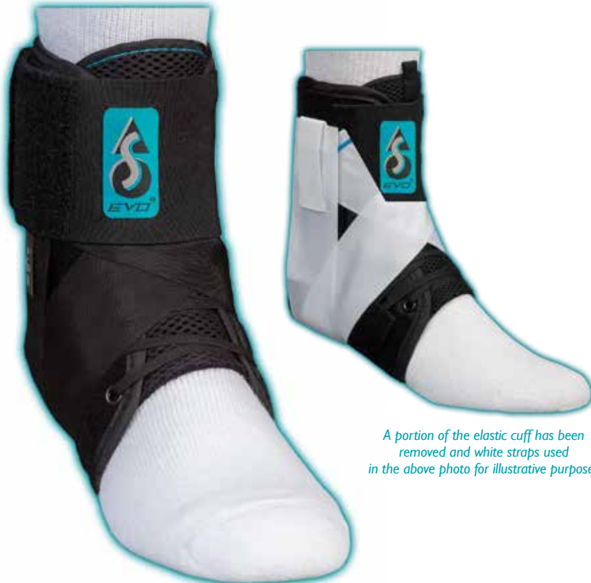
A portion of the elastic cuff has been removed and white straps used in the above photo for illustrative purposes