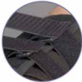
V-Strap retention system