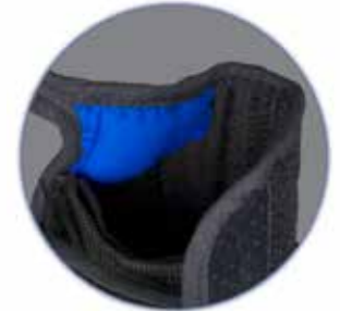
blue palmar pad