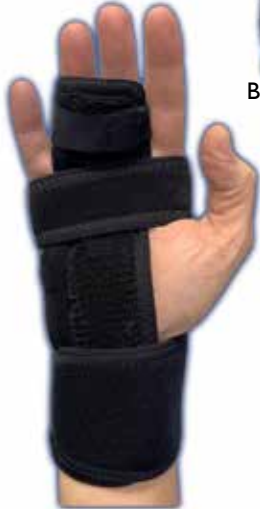
3rd & 4th Buddy Splint