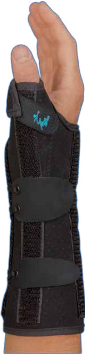
Long Ryno Lacer II